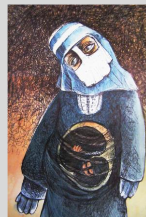
Illustration for a magazine about women's rights & religion